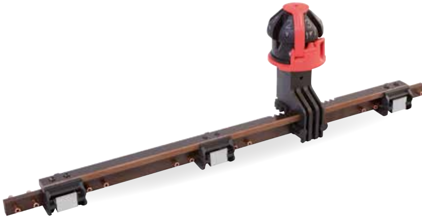
090 Series - Bridge connection

C.A.P.T. tap changers from DT series are specifically designed for applications where rated current is up to 200 Amps and voltage up to 36 kV. A wide range of solutions is offered, from switches with direct drive, up to cable applications, and also rotary tap changers: this series can cover almost any requirement in the field of Distribution Transformers.