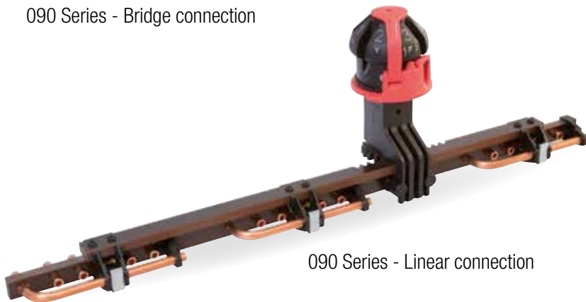
090 Series - Linear connection